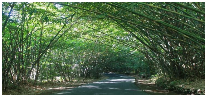
Picture3 https://dynamic-media-cdn.tripadvisor.com/media/photo-o/0b/c6/bc/14/panglipuran-bamboo-forest.jpg?w=1200&h=1200&s=1 Bamboo Forest -