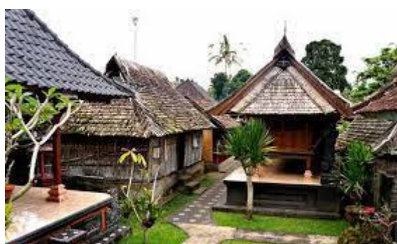
Picture 2 Rumah Adat Desa Wisata Penglipuran

Every tourist who comes to Penglipuran Bali Village must be curious about the traditional houses in this village. When tourists come, of course, they are allowed to enter every citizen's house which also offers a variety of products made by them. Therefore, in addition to selling their products at home, the residents of this village also maintain the traditional culture of their ancestors, so the building of every citizen's house in this village is still very traditional. Each resident's house in this village has several parts that have their respective functions. The following are the parts of the Penglipuran Balinese Traditional House and their functions, namely: 1) Merajan or commonly called sanggah which is a family prayer place 2) Bale Sakenem, which is an open pavilion and has halls that have various functions ranging from being a place of worship, mepayas (wedding ceremonies), death ceremonies, mepandes (cutting teeth), and places to do daily activities such as making crafts. 3) Paon or what people generally say is that the kitchen is a place to cook and prepare food as well as a room to eat together when there are certain events. 4) Bale Dangin or what the villagers call "Loji" is the residence of the head of the family for those who have married. (Loji), 5) Angkul-angkul is a gate or entrance to the traditional house of Penglipuran.