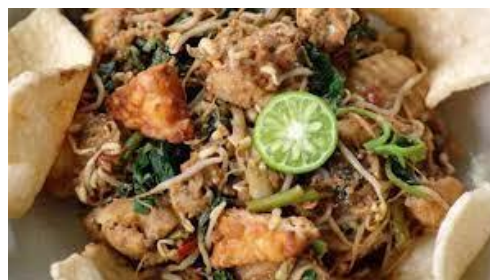
Picture4 https://www.hargatiket.net/wp-content/uploads/2019/12/wisata-kuliner.jpg - Tipat Cantok