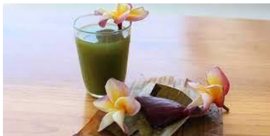
Picture5 https://asset.kompas.com/crops/jLDMuZh3eWboY5lv9phZ-HrIdIM=/0x0:470x313/780x390/data/photo/2021/08/11/61139816bce20.jpg - Loloh Cemcem

In addition to the natural beauty and culture in this village, it turns out that this village also has culinary delights that are very appetizing and become an attraction for tourists who come. "Loloh cemcem and Tipat Cantok" is a typical Balinese cuisine available in this village. "Loloh Cemcem" is a special drink made from cemcem leaves or cloning leaves which are made traditionally and without preservatives or artificial sweeteners. This drink is efficacious for digestion. "Tipat Cantok" is a typical Balinese ketupat served with boiled vegetables and doused with peanut sauce.