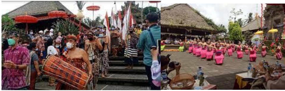
Picture 6 Penglipuran Village Festival