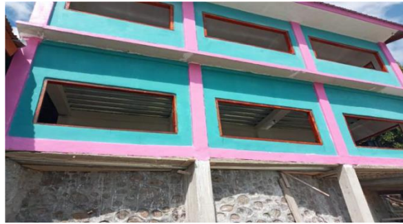
Figure 3. Café and Homestay Building

In the beginning, Riang Tanah Tiwa Cultural Studio only performed in the courtyard of the head of the studio, then after many tourists visited, the studio started to build homestays, canteens, toilet culture houses and hand washing facilities. In 2021, Riang Tanah Tiwa Cultural Center is constructing a building which is planned to be used as a homestay and café.